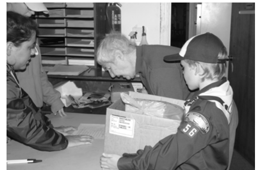
Lanesville's Cub Scout Pack #56 was on hand all afternoon to help people to their cars with their bags and boxes.