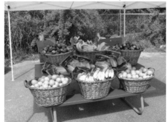
Fresh fruits and vegetables are distributed weekly at four Mobile Markets on Cape Ann: Riverdale, Willowood, Kitefield Road, and Pathways for Children. New site in 2009.