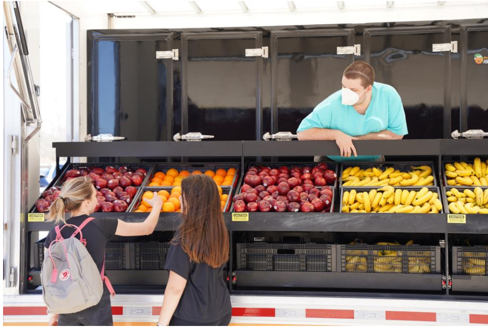
Students choose fruit from The Open Door Mobile Market Farmers Truck.