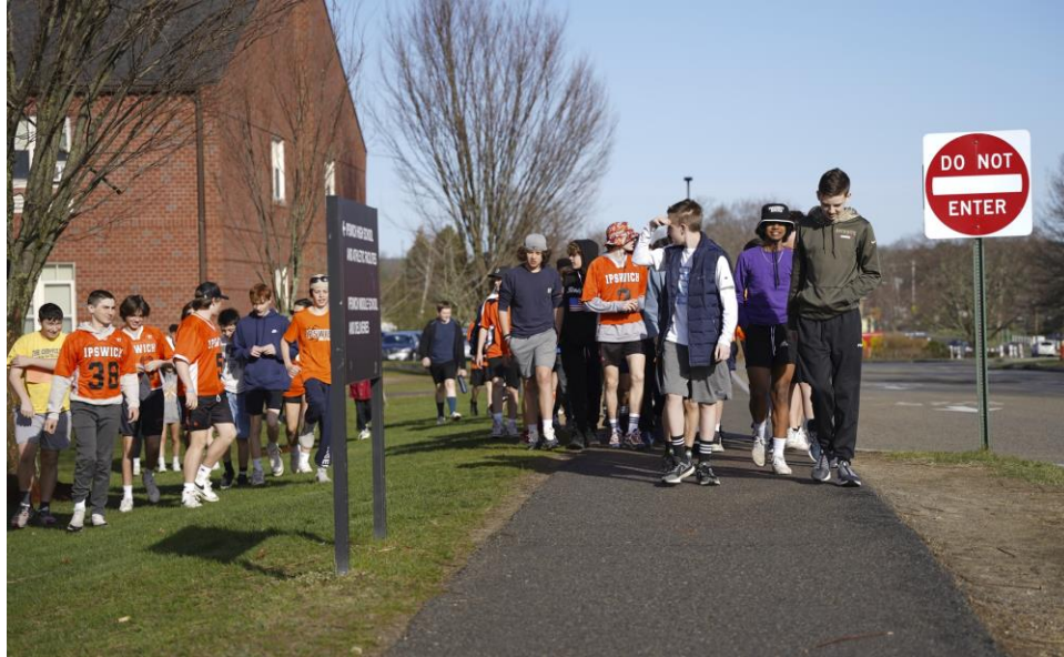
Ipswich Middle School students walked approximately 10 miles on Friday for the school's annual Walk for Hunger, raising funds to support the Ipswich Community Food Pantry, a program of The Open Door.